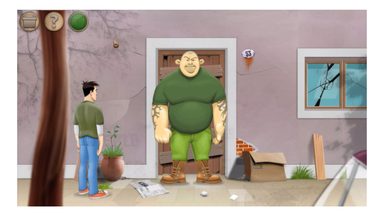
Reversion - The Meeting (2nd Chapter) Free Download [PC]

Download ->>->> <a href="http://bit.ly/2SMIr7F">http://bit.ly/2SMIr7F</a>